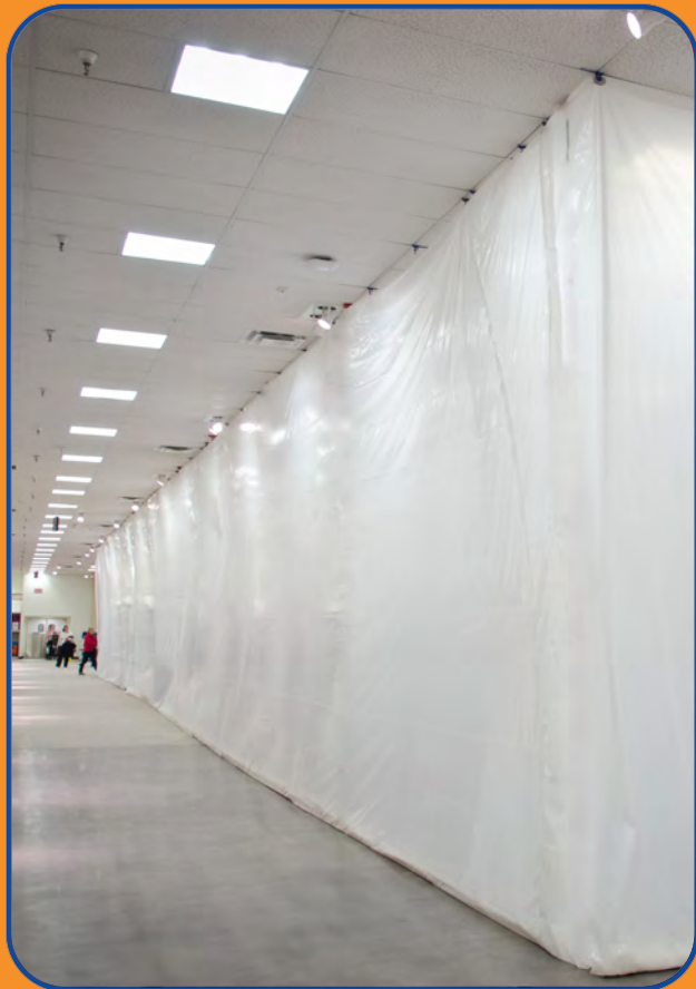
(US Patents #5203529 and #5207403)

Support poly sheeting to build containments or dust barriers